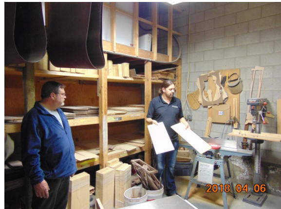
Downstairs we are taken from wood purchase to finished guitar.