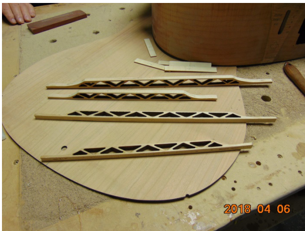
In-house designed internal bracing pieces.