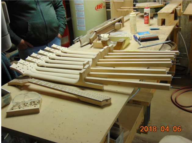
Patented neck extensions are added for balance and strength.