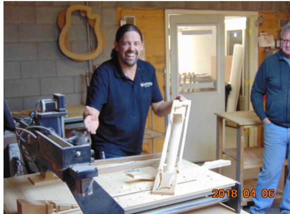
Necks are cut out by CNC machine.