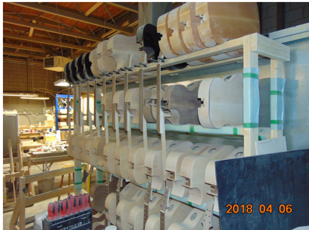
Ready for finishing by Massa.