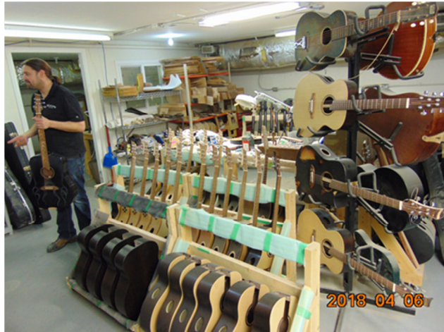
More guitars awaiting finishing.