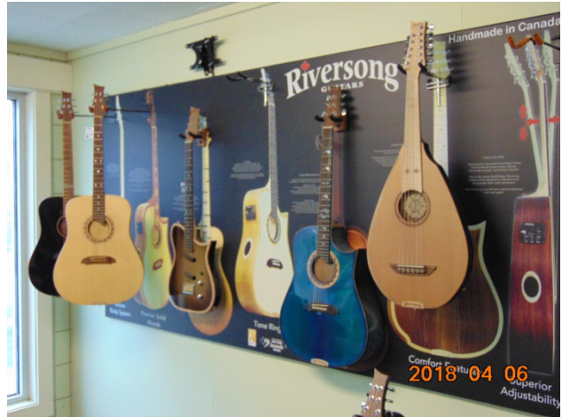
He took us through their development step-by-step.