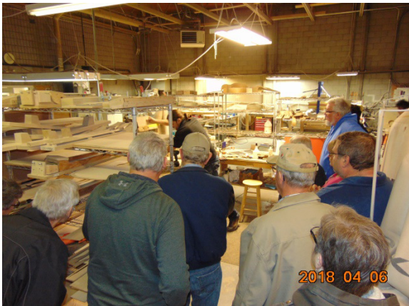
A quick overview of the factory.