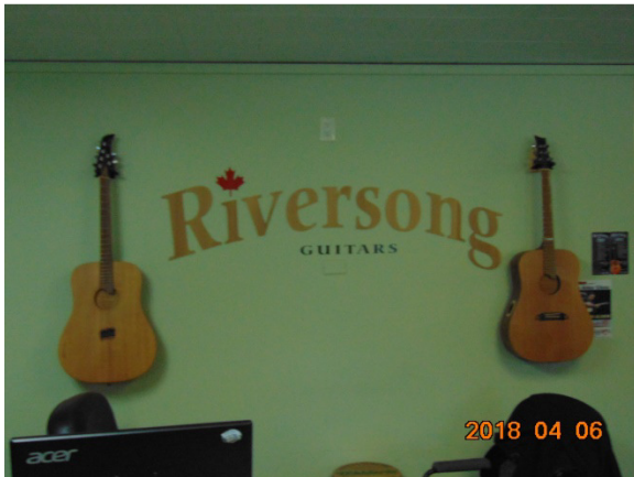
This is their logo and entrance wall.