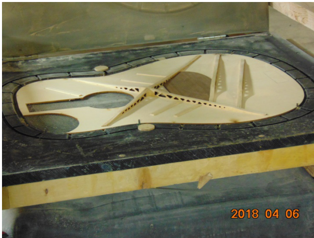
Internal structure is vacuum glued.