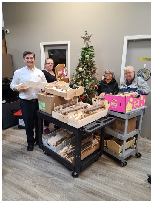
Terry's Christmas Amalgamated Toy Donation